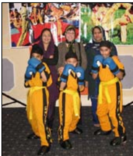
Sikh School of Arts were awarded £3,300 to introduce a kick boxing club to West Bromwich.

The report highlighted the tremendous impact which Grassroots Grants had on its recipients. For many organisations, Grassroots Grants was literally a lifeline, enabling them to continue operating or enhance their services. The flexibility of the scheme was highly valued and while most grants were spent on rent, equipment and general running costs, others were spent on volunteer expenses, training for users, staff costs and publication production. Groups were also able to reach more or different people, thereby raising the profile of their work. For many groups the grant eased the pressure on fundraising allowing them to focus on service provision and future planning.