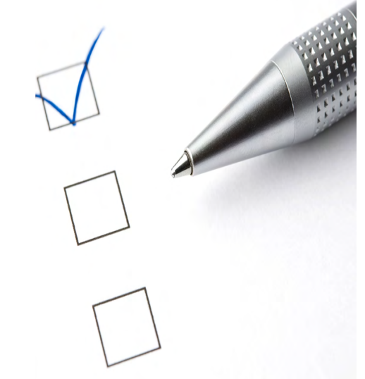
by Friday 29 June 2012.

Please complete the survey and return it to the Freepost address